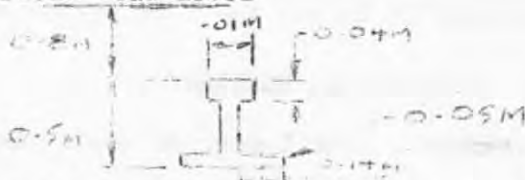
Wakefield Road level

It was possible to climb down into the cavity beneath the girders. The sight was incredible, it was more like a cavern, literally hundreds of stalagmites and stalactites.